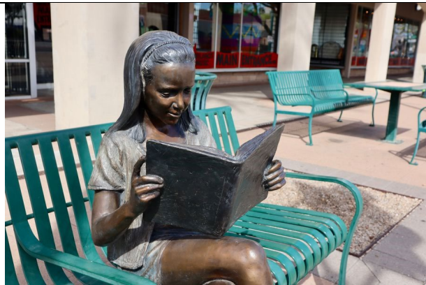
Booked for the Day, 38 W Main St. Mesa

This is a documentary about the national spelling bee.