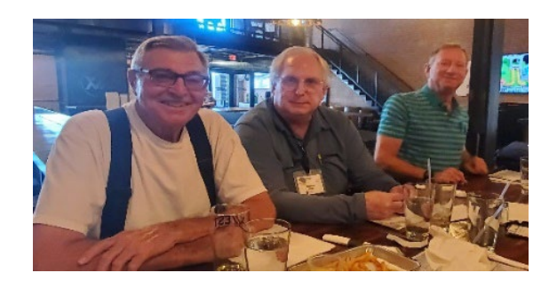
THERE'S MORE ON THE NEXT PAGE!