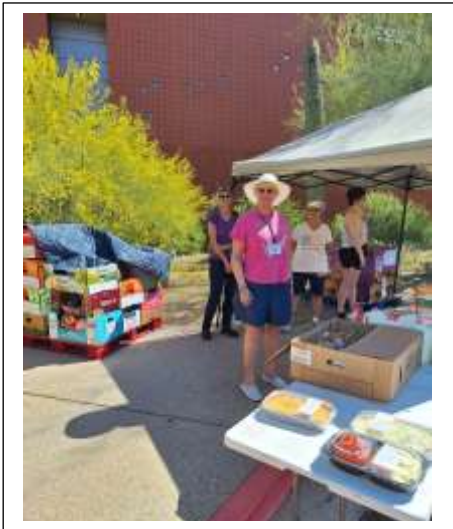
Handing out food at We Care Wednesdays.

During 2023-2024, members reported supporting NFLL, MCC and the community with a total of 3,964 hours. Those hours have a value of $127,141.52.