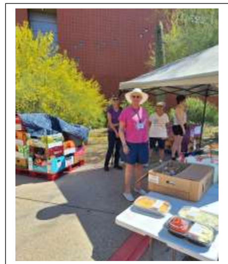
Handing out food at We Care Wednesdays.

During 2023-2024, members reported supporting NFLL, MCC and the community with a total of 3,964 hours. Those hours have a value of $127,141.52.