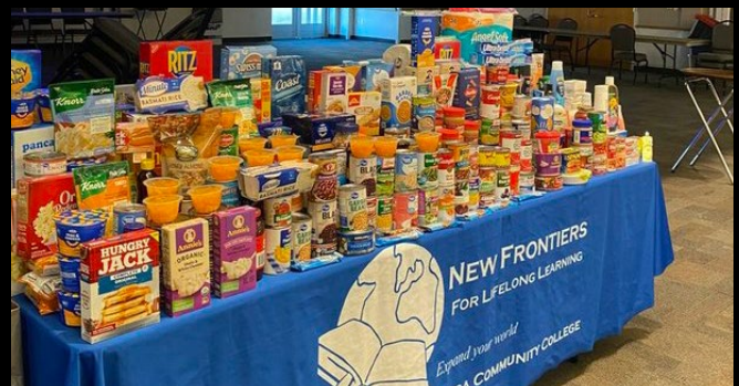
Once again you provided hundreds of items to give to MCC's Mesa Market.