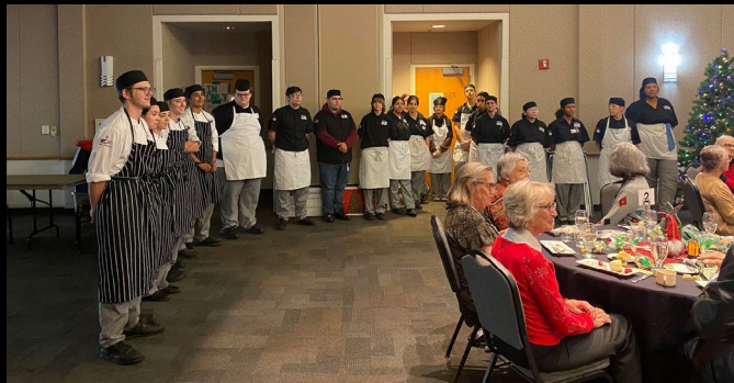
The students and staff from Culinary Arts at EVIT created and served outstanding food and impeccable service.