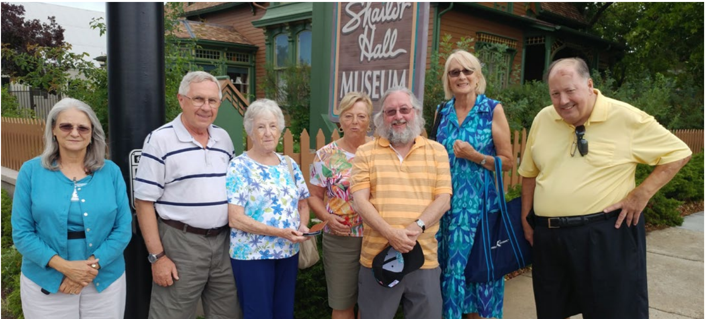
Sharlot Hall Tour - July 26, 2016