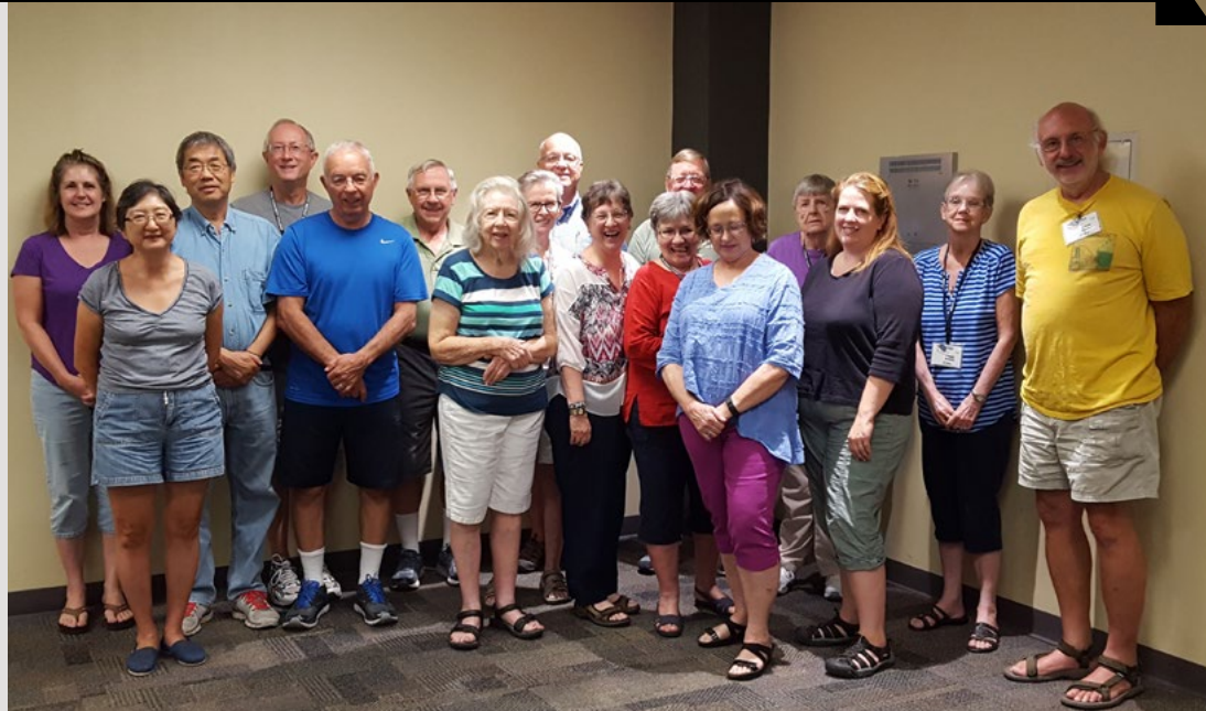
Curiosity Never Retires

For additional information contact membership@newfrontiersaz.org